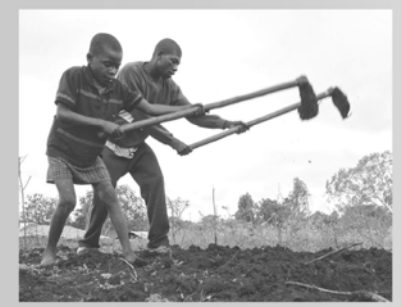
$100 can provide tools for such trades as carpentry, plumbing and tailoring for refugees, asylumseekers and survivors of trafficking who have skills but lack the necessary tools

$225 can provide gardening tools and materials to build three small raised beds for vegetables.